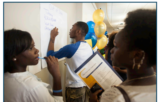
Students attending FYE review list of issues they will confront as first-generation college students

He continues to be involved with CAP through the Scholars’ Mentoring Program and