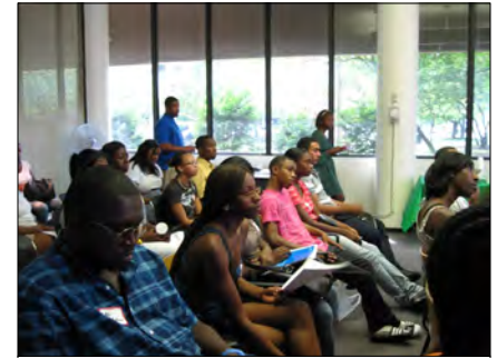
Students listen to expert advice at First Year Experience 2013.

A huge thanks to all our donors and sponsors who made this event possible.